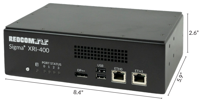
REDCOM Sigma® XRI-400 delivers maximum interoperability in a low-SWaP design weighing just 2.6 lbs (1.2 kg).

Even the most disparate parts of your radio network can be bridged together with the XRI to facilitate encompassing and effective command and control. The XRI also integrates with analog technologies for interoperability between cutting-edge and legacy architectures.